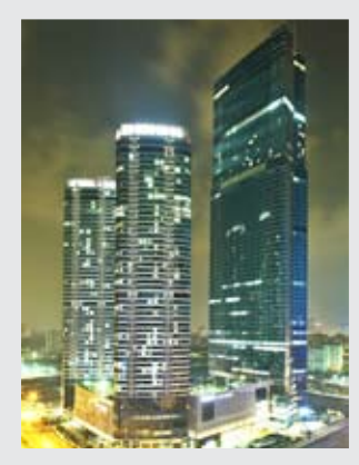
Hanoi Landmark Tower (72 Fl.)