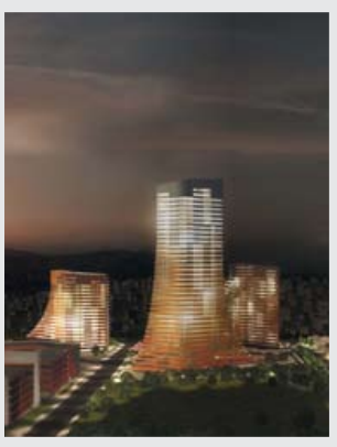
Varyap Meridian Hotel (58 FI.)