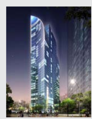
Park-Hyatte Hotel (34 Fl.)