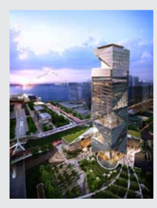
Songdo I-Tower (33 Fl.)